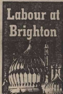
Labour at Brighton

Let us hope that when Labour's dreadful soap opera reaches its climax at Brighton tonight, the show will be declared well and truly over so that the party can get down to its proper job.